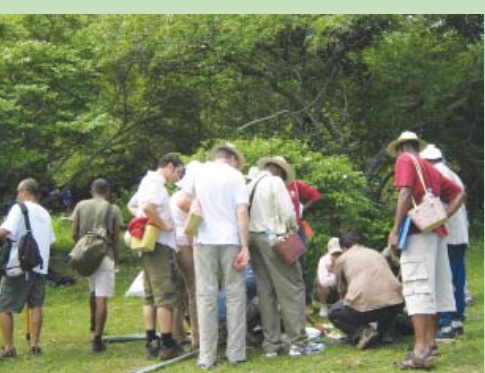
Bioprospecting field trip

Bioprospecting involves searching for, collecting, and deriving genetic material from samples of biodiversity that can be used in commercialized pharmaceutical, agricultural, industrial, or chemical processing end products. By the early 1990s, objections to uncompensated bioprospecting that does not share benefits with the source country became contentious. Since 1991, the Convention on Biological Diversity (CBD) has embodied the principles of compensated bioprospecting globally.