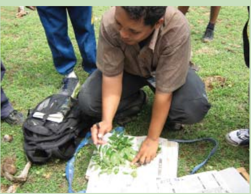
Demonstration on mounting a herbarium specimen

Passport data was taken including data on the vegetative parts of the tree, i.e. its height, trunk diameter, colour of the leaves, flower, etc. In most cases, samples are then deposited to a local laboratory where extractions are done and sent for further processing most commonly to developed countries.