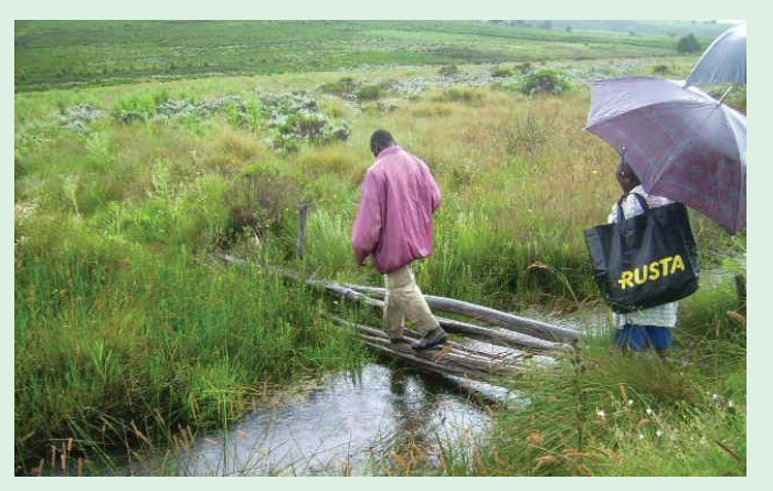
Photo 2: Expeditious and overexploiting collection of plants for sale