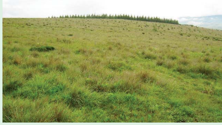
Photo 3: Cypress forest plantation established at the heart of a prime area for orchids collection and habitat

While trade poses a major threat, facts remains of other threats including, changes in land use pattern, expansion of agricultural land and growth of human enterprise (Cribb and Leedal, 1982; Niet and Gehrke, 2005; Hamisy and Millinga, 2002; Gaston and Spicer, 2004), all are potential competitors to orchid habitats. Further alerts on the possible rate of threats to extinction, is when orchid habitat is competed by the forest plantations (Davenport and Ndangalasi, 2003; Hamisy, 2005; Niet and Gehrke, 2005), the growing economic activity in marked districts with high demand of land. Habitat loss/degradation holds the first position among species extinction threats, hence the need for its attention (Baillie, 2004).