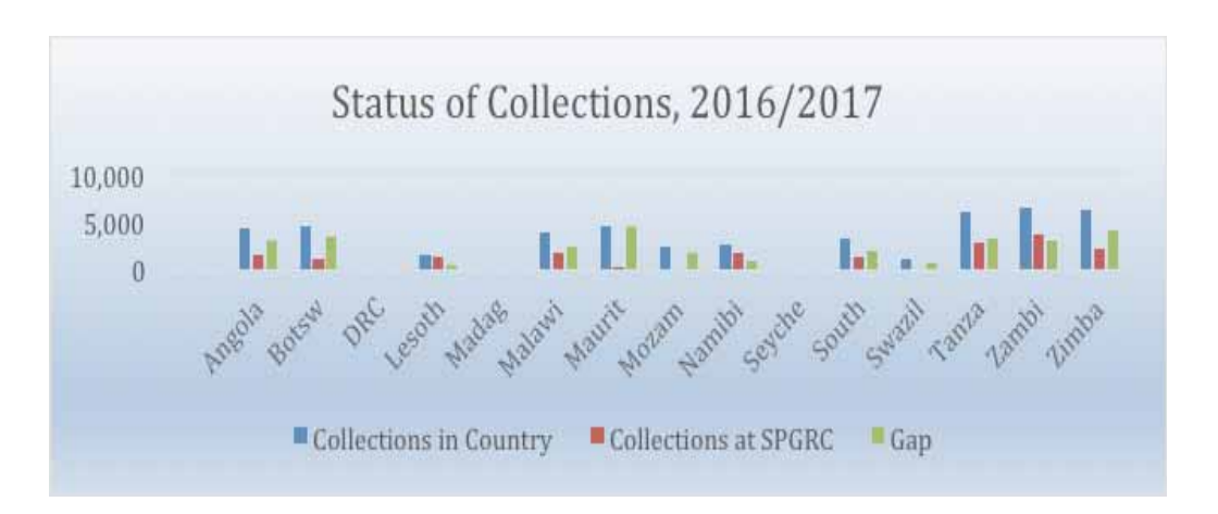
Figure 4.2: Number of accessions by country and duplicates at SPGRC