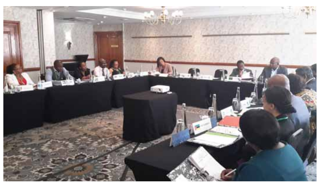
SPGRC Board in Session, Johannesburg, 2016

The Board adopted the pre-defined agenda and discussed minutes of the immediate previous meeting from which the board was updated on matters arising that included progress made on SPGRC Addendum to the MoU Establishing SPGRC, planned SPGRC donor meeting, capture and maintenance of in-situ conservation data, status of breakdowns of genebank equipment and facilities, and migration of the SPGRC Documentation & Information System (SDIS) from current standalone to a web platform.