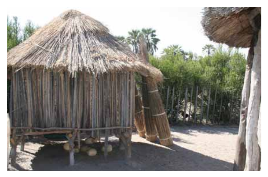
Traditional maize storage, Tubu Village, Botswana

In Zambia, a farmer training workshop was carried out at Sithumbeko, to sensitize smallholder farmers to include climate smart factors in their production systems and to equip them with the knowledge on seed multiplication. Farmers brainstormed on experiences indicating changes in rain patterns and other effects of climate change such as delayed on-set of rains, prolonged interval of dry spells during the