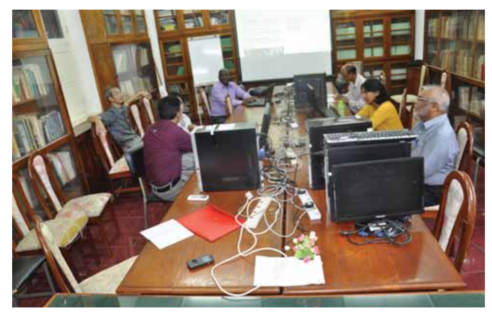
Interactive training on web-SDIS, Mauritius

The system has already been installed in 14 SADC Member State genebanks (Angola, Botswana, DRC, Lesotho, Madagascar, Malawi, Mauritius, Mozambique, Namibia, Seychelles, Swaziland, Tanzania, Zambia, and Zimbabwe), with the last one being conducted in South Africa in the near future. Web-SDIS installation and staff training for the newly admitted Comoros is planned for the future.