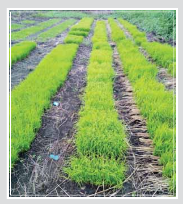
More than 800 regional rice accessions being regenerated at Lifuwu Research Station in Mlaawi, for SPGRC