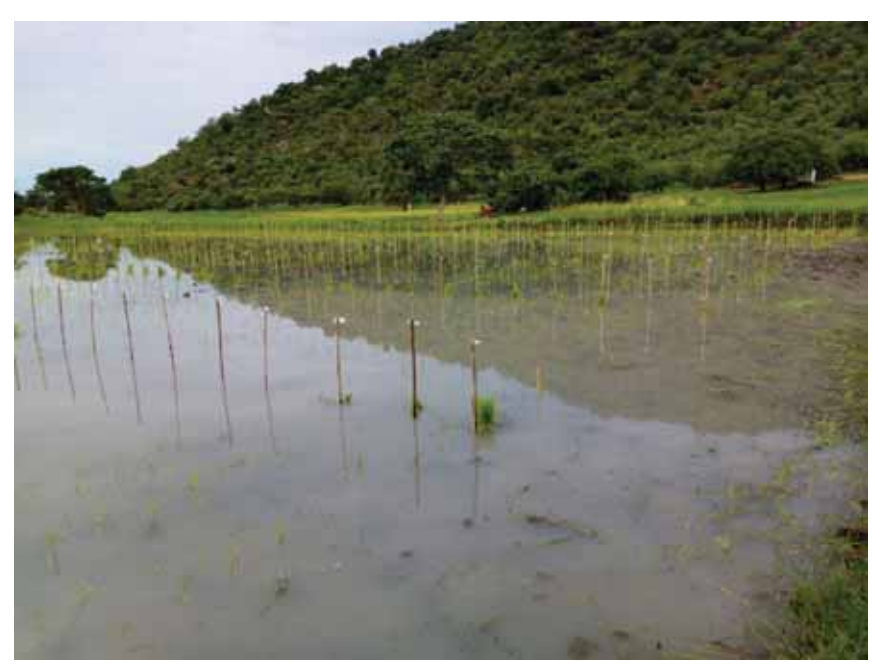
Young rice crop at Lifuwu Centre, Malawi

Four crop species namely Zea mays, Sorghum bicolor, Vigna unguiculata and Pennisetum glaucum were sown for seed multiplication during the 2016/17 planting season. A total of 255 accessions were planted of which 65 were Zea mays, 91 were Sorghum, 12 were Pennisetum glaucum and 87 were Vigna unguiculata.