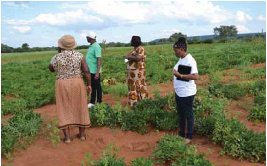
Seed collection from farmers' fields, Botswana

This activity is mainly done by national In-Situ/Collection Officers and the SPO provides technical expertise when need arises. In practice, adequate seed quantities should be collected for conservation, distribution to end users and deposited at SPGRC for Base collection. However this is not always practical depending on the availability of material from the donor or farmer during collection missions. This is why it is important at the time of receiving material; by Curators to document or register whether the sample is accepted for conservation or pending for further multiplication to meet the required quantities.