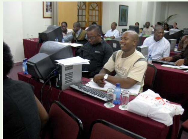
After theoretical part of the data analysis using NTSYSpc package, course participants had ample time to work hands-on in a specially set-up computer laboratory at Arcadia Hotel, Pretoria.

Use of plant genetic resources in genebanks is laden with a number of factors, one of which is the availability of useful information associated with the conserved germplasm. SPGRC has been organizing workshops for NPGRC officers to get acquainted with analytical tools that will add value to germplasm. To pursue this, SPGRC, with support from NGB organized a special training workshop on Numerical Taxonomy System (NTSYSpc) statistical package that was held in Pretoria, South Africa from 12 to 16 th February 2007. Two participants were drawn from each of the SADC member states except for DR Congo who did not attend.