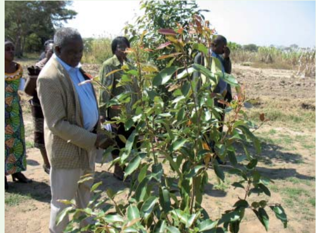
The Minister visited the field and in the photograph is seen admiring one of the conserved plants whose economic value is being assessed

He then proceeded to visit the farm where he saw by himself multiplication of accessions, arboretum with wild fruits and medicinal plants.