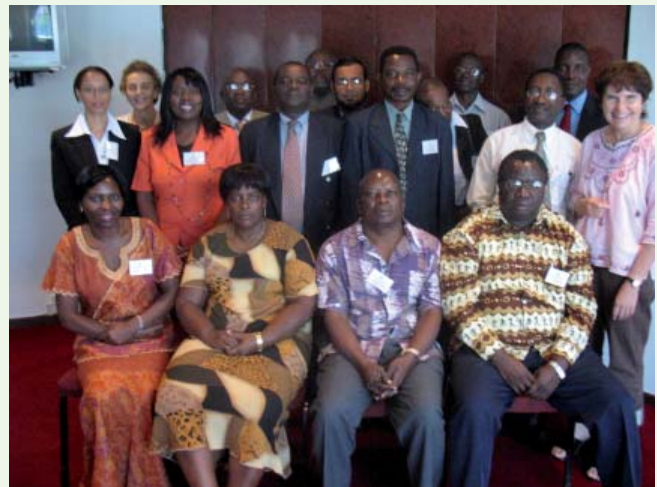
Photo group of Board Members who met in Pretoria

After discussing the Long-Term Sustainability Strategic Plan document, the Board instructed SPGRC management to complete it by incorporating comments and recommendations by the end of February 2007 and electronically circulate it for clearance by the Board before it is presented to the Integrated Council of Ministers (ICM) in June 2007. It will then be forwarded to the SADC Council of Ministers in August this year.