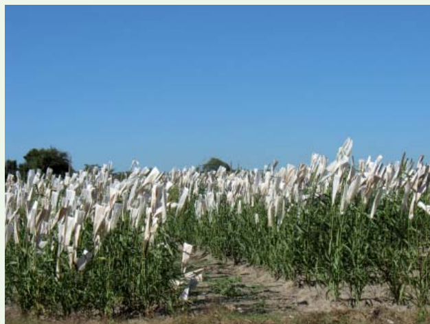
SPGRC is building up its capacity to cope with the increasing load of support to NPGRCs' multiplication requests

In summary, from 726 accessions, 664 (91%) produced adequate seed for sharing between the active and the base collections. Beans and sesame were being regenerated alongside multiplication and largely contributed a large portion of 62 (9%) accessions that did not germinate at all. Some accessions were received from national genebanks with incorrect or missing some data, this was observed in all crops except pearl millet. When data was further studied, some accessions were duplicates of accessions that already existed in the base collection, this was particularly true for pearl millet and sorghum. Post harvest handling also posed a little problem that led to rejection of a few accessions. In summary, multiplication work resulted in 570 (86%) accessions registered and stored in the base collection, and finally distributing duplicate seeds in 3437 small foil packets back to respective NPGRCs for utilisation.