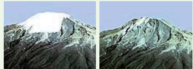
If most of the summit of the Africa's highest mountain (Mt Kilimanjaro) was covered by ice in 1912s (left), by 2000 (right photo) it had receded alarmingly

Global warming affects many different facets of life on Earth. Globally, the losses are expected to far outweigh the benefits and regions most severely affected are often the regions that emit the least greenhouse gases, one of the challenges that policy-makers face in finding fair international responses to the problem.