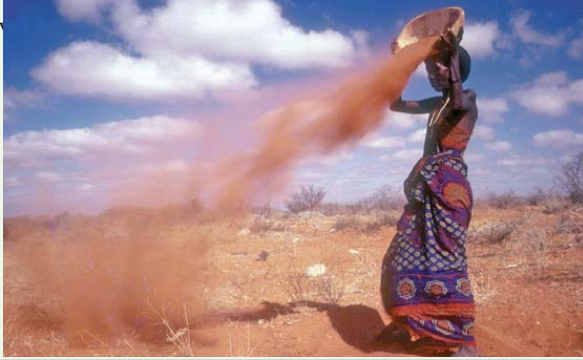
Searching for edible seeds among the desert-ridden dust

Plant genetic resources (PGRs) highly contribute to taming hunger and in ensuring food security since it provides basic raw materials for making crops adaptable to: biotic/abiotic stresses, consumer preferences; and possible changes in the environment. They should therefore be ably managed particularly in the areas of ex-situ and in-situ conservation; on-farm community conservation and utilisation; monitoring and early warning of genetic erosion. Greater efforts must be exerted on development of techniques for sustainable advances in agricultural productivity as well as on.